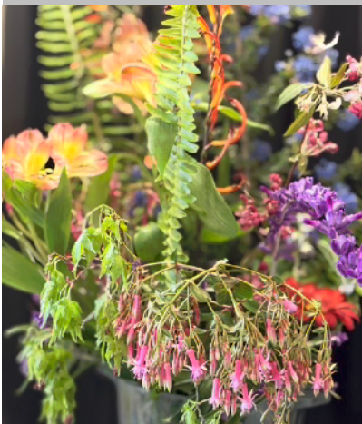
One of the lovely flower arrangements.