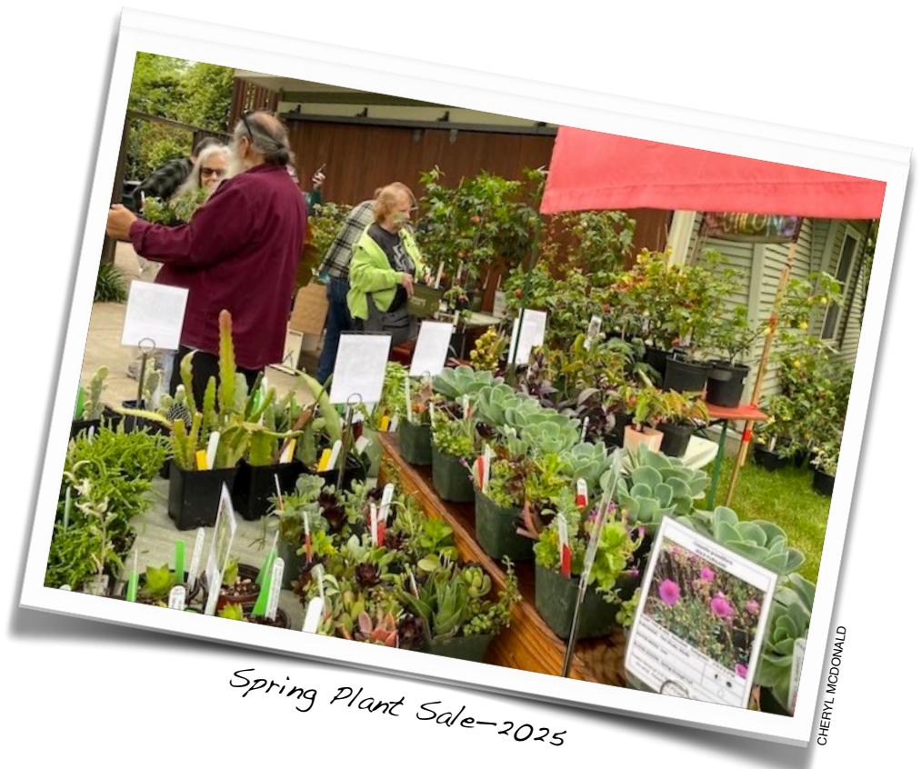
Spring Plant Sale-2025