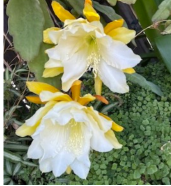
Yellow & White Orchid Cactus