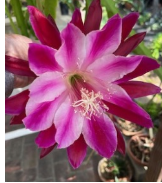
Maine Red Orchid Cactus