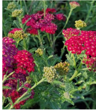
Red Velvet Yarrow