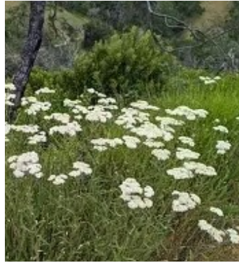
California Native Yarrow