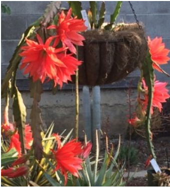
Clown Orchid Cactus