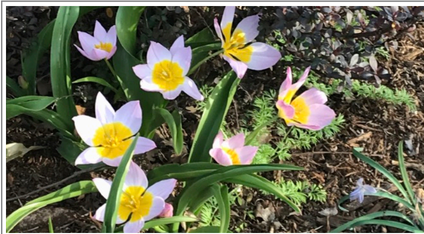
Tulipa bakeri 'Lilac Wonder'