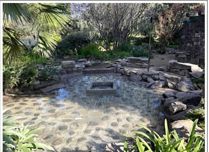
View of renovated pond in WPA Rock Garden.

A contractor was hired. The base of the pond was sealed and a couple of large, on-site slabs of granite, were relocated and repurposed into benches. Granite rock edging of the planting beds, that wrap around the pond, was reset. A wish list of distinctive grasses, shrubs and succulents will be planted by Daisy.