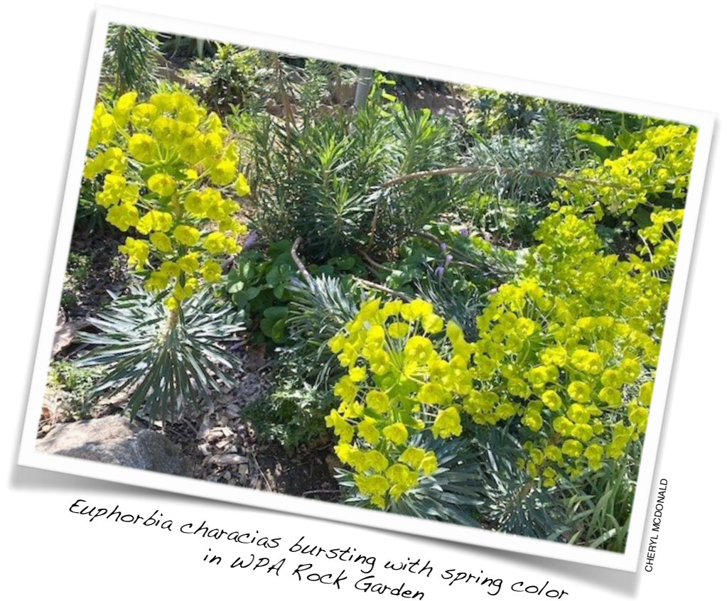
Euphorbia characias bursting with spring color in WPA Rock Garden