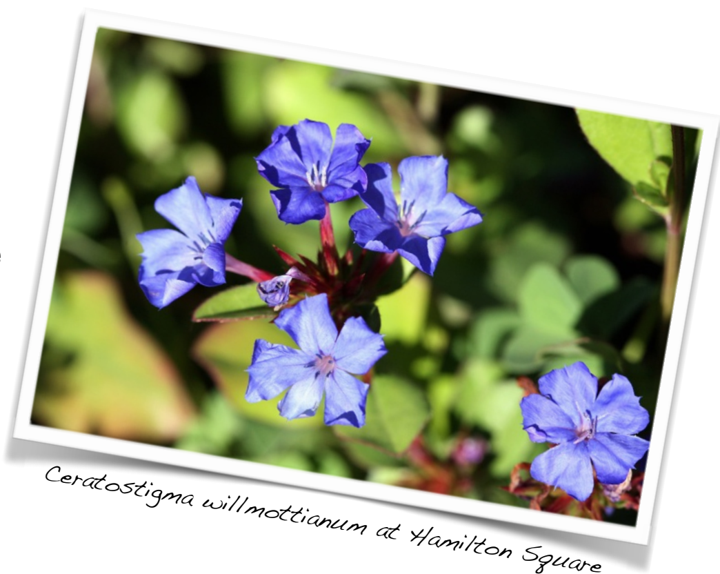
Ceratostigma willmottianum at Hamilton Square