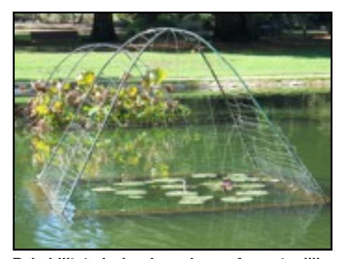
Rehabilitated wire-domed cage for water lilies

marauding waterfowl. But in a few years, the hardy water lilies were overcrowded and worse yet, unattractive. Before I could replant, the old needed