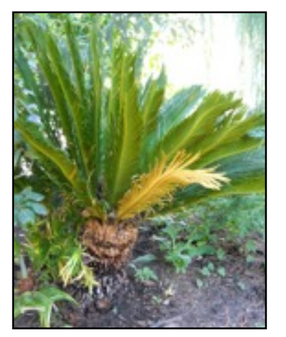
A recently donated sago palm

After six years or more of battling pennywort, I finally but cautiously claim victory. It had begun an aggressive campaign of running rampant and clambering over and up anything in its wake. Without intervention, the only barrier was the water that surrounds the island in the Boat Pond. Additionally, elderberry seedlings and saplings were dueling for supremacy making passageways impassable. Unlike the pennywort, these were relatively easy to weed out. Armed with wire cutters and loppers, we corrected many of the tripping hazards. Recent additions include eastern dogwoods, sago palms, Gunnera, CA native