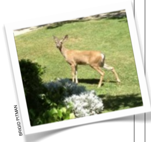
A surprise visitor at Madeleine Mullin's home in East Sacramento.

Learn about growing cover crops and how they can enrich your garden soil. Get tips for protecting sensitive plants from frost damage. 10 a.m.-1 p.m.