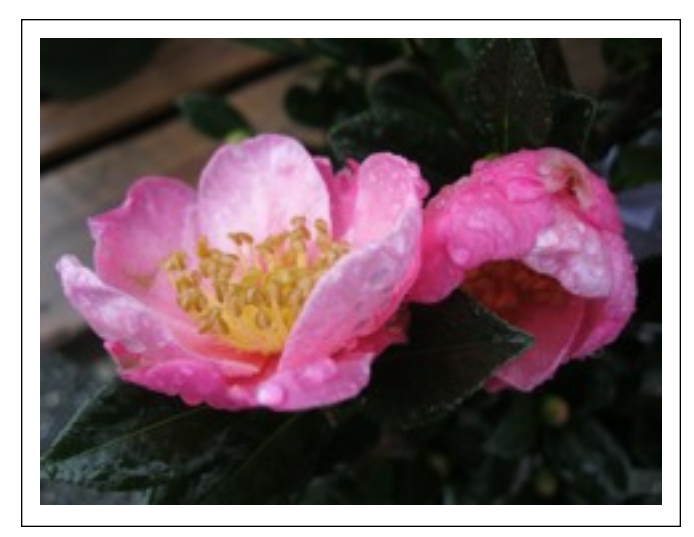
C. sasangua, "Pink-A-Boo"

My wife purchased another Camellia. By my count, this is her 23rd Camellia sasanqua in her collection. This one is an exceptional pink-flowering sport of the Camellia sasanqua 'Yuletide.' Unique not just in color, the blooms of 'Pink-A-Boo' are larger and showier, having seven petals rather than five, and boast a remarkable, sweet fragrance. This Camellia was introduced by Monrovia in 2011.