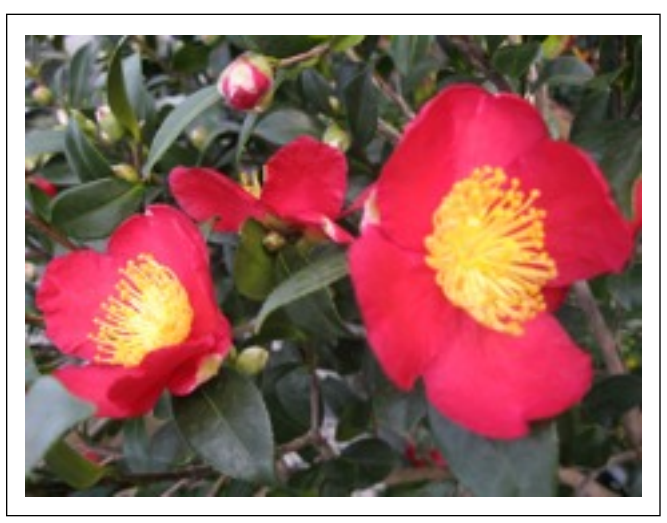
C. sasanqua, "Yuletide"

C. sasanqua 'Yuletide' is an example of upright growth. This is one of the only true reds found among the fall blooming camellias, and the plant has a wonderful compact form with small dark green leaves. 'Yuletide' looks good in containers or planters, especially when blooming, but can be used in the garden as a border plant or even a hedge plant. Slow growth 8 to 10 feet tall and wide. Flower time is December into January.