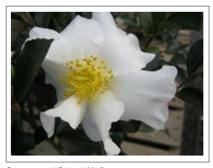
C. sasanqua, "Setsugekka"

An excellent choice for a colorful hedge or screen, espalier, and border shrub is C. sasanqua 'Setsugekka' displaying large, perfectly formed semi-double white flowers with ruffled edges and a bright cluster of golden stamens at the center. Flower time is October to early December with moderate upright growth to 8 to 10 feet tall and wide.