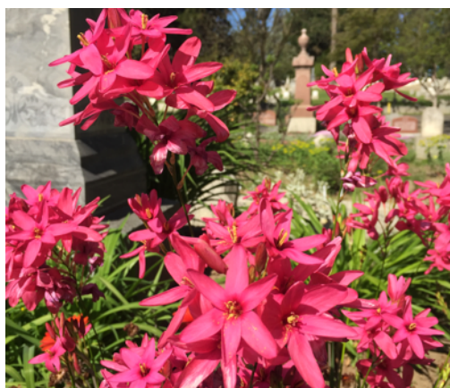
Ixia longituba var. bellendenii