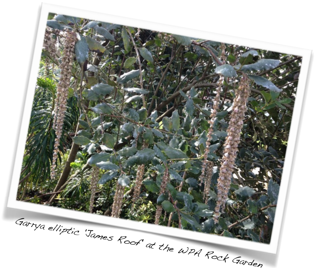
Garrya elliptica 'James Roof' at the WPA Rock Garden