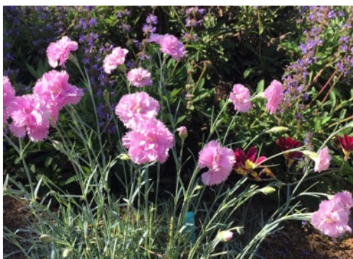
Dianthus plumarius 'Rose de Mai'

The bees will soon be swarming and the place to be is at the Historic City Cemetery. This history-filled landscape of carriage paths is lined with memorials, monuments and gardens that grace it with utmost respect. When you visit the Historic City Cemetery in Sacramento, I encourage each of you to come for a stroll to see the SPPC sponsored Hamilton Square Garden. The next guided tour will be a joint tour of the Historic Rose Garden and Hamilton Square on Saturday, March 25th at 10 a.m. starting at the front gate. Outside street parking only. Mother nature has set the perfect stage this year for a spectacular show! Here's a little peek of the "Blooms from the Tombs."