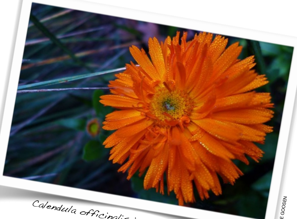
Calendula officinalis in WPA Rock Garden

Sacramento Perennial Plant Club Membership—2016